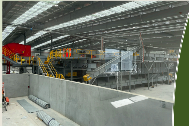
Veolia at Spreyton sort material & prepare it for re-processing

When Material is collected from your recycling bin in the North West, where does it go?