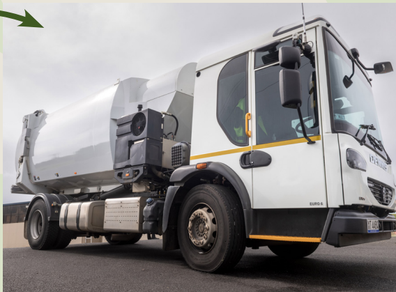
Council or Contractor collects bin contents